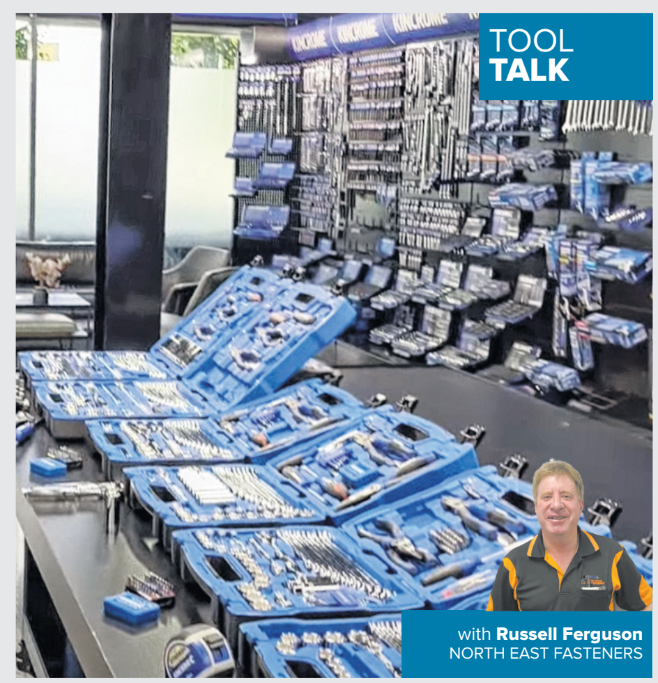
♦ COMPACT AND PORTABLE: Kincrome's blow mould case portable tool kits are convenient